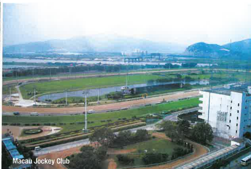
Macau Jockey Club